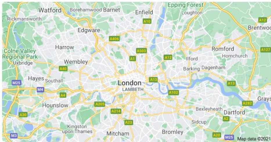
London, United Kingdom