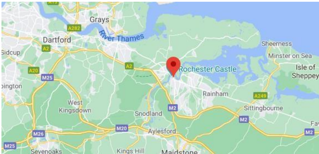
Rochester, Kent, United Kingdom