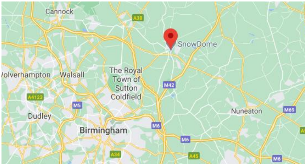
Tamworth, Midlands, United Kingdom